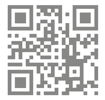
By the way: You can find these and other products on our website.